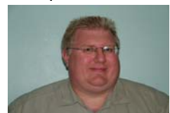
Have No Fun !