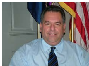
Jim Mahone Communications