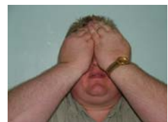
See No Evil