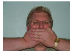
Speak No Evil