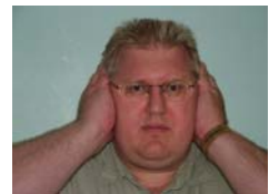
Hear No Evil

The appearance of a tax sticker is more important than the tax itself. Although the sticker was larger than legal, it took more news space than issues of property tax enforcement. You see them. Vehicles with out of state plates in your neighborhood for years at a time. Tax stickers from other counties always parked in your neighborhood (aka garaged). These "folks" are cheating you and the county. They suck up county services like fire, police, schools, and more, but pay no personal property taxes. This should be the news story and NOT the size or prettiness of the sticker. Let's go America—get it in perspective!