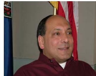
Nauri Ahmed Leadership Awards