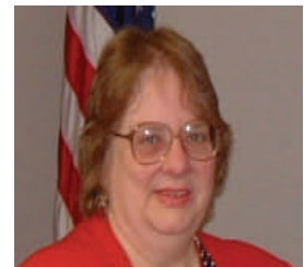
Betty Akins Awards