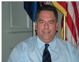
Jim Mahone Communications