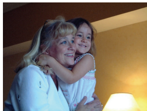
Renee Gilman Communications